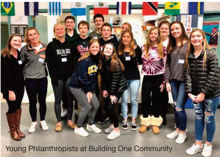
Young Philanthropists at Building One Community