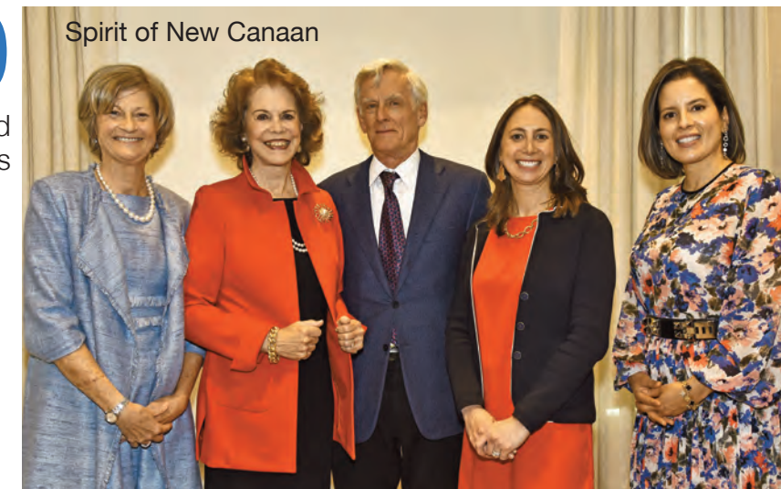
Spirit of New Canaan

over 450 guests honored our five awardees