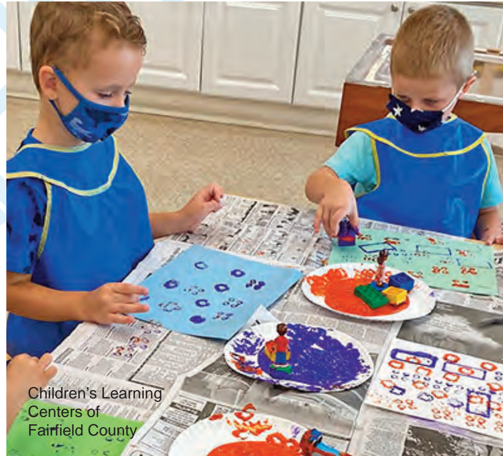
Children's Learning Centers of Fairfield County