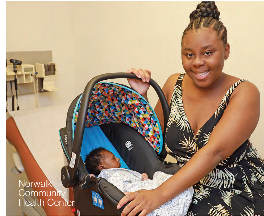
Norwalk Community Health Center