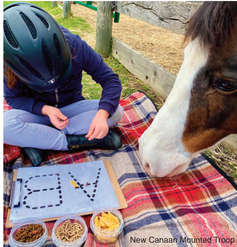
New Canaan Mounted Troop