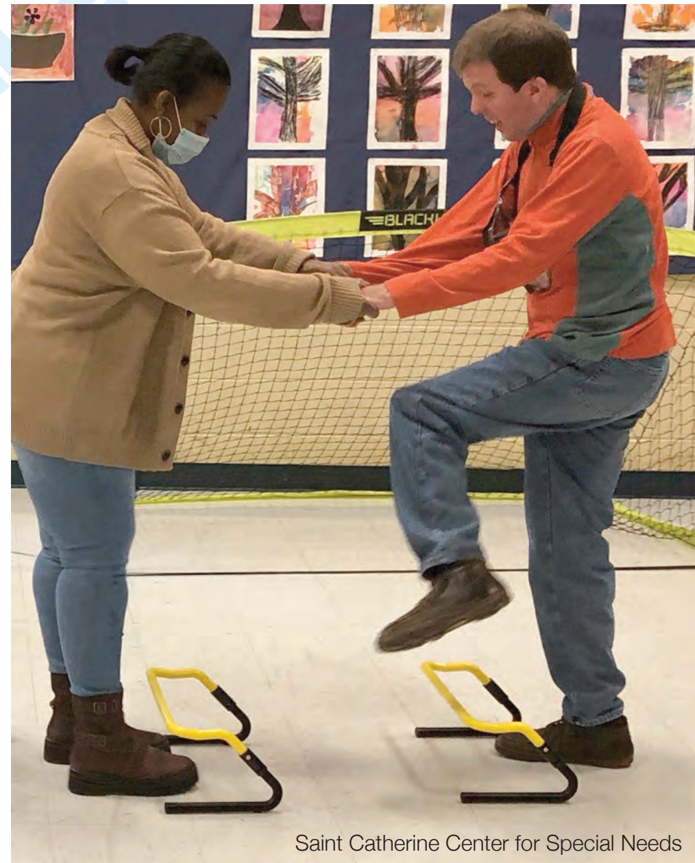
Saint Catherine Center for Special Needs