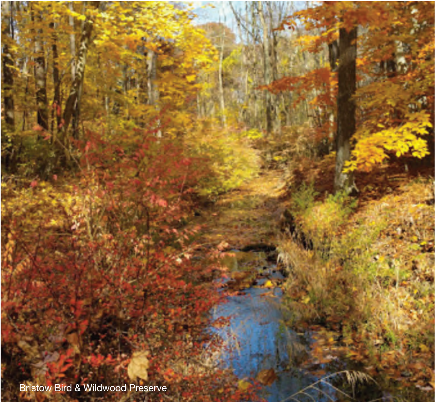
Bristow Bird & Wildwood Preserve