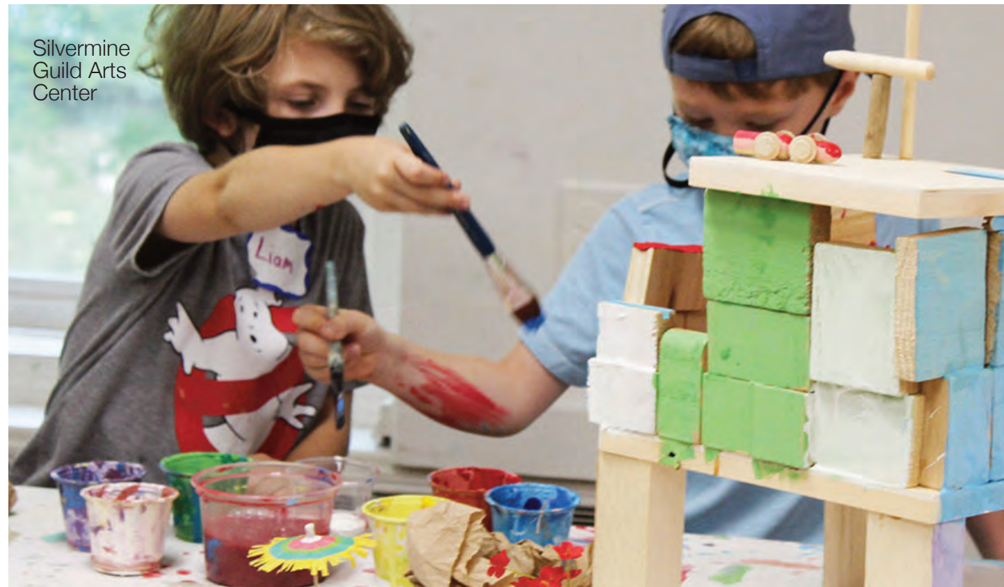
Silvermine Guild Arts Center

Youth have the academic, social, and financial support they need to succeed.