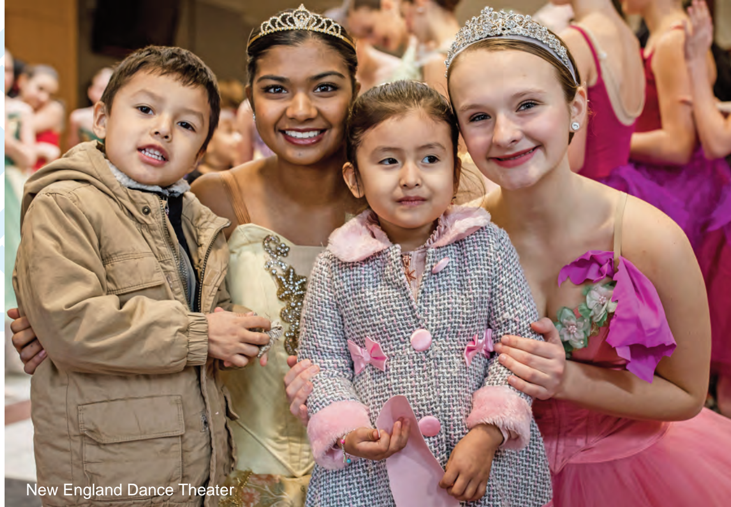
New England Dance Theater