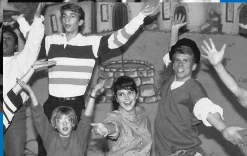
Grants from the Noble Fund have also supported New Canaan Town Players for over 20 years. This funding enables the production of exciting community theater like "Jack and the Beanstalk".