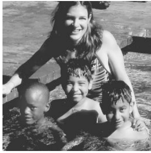
A grant from the NCCF endowment fund helped establish Camp Hand-In-Hand, a new summer day camp. The camp brings together children of diverse backgrounds.